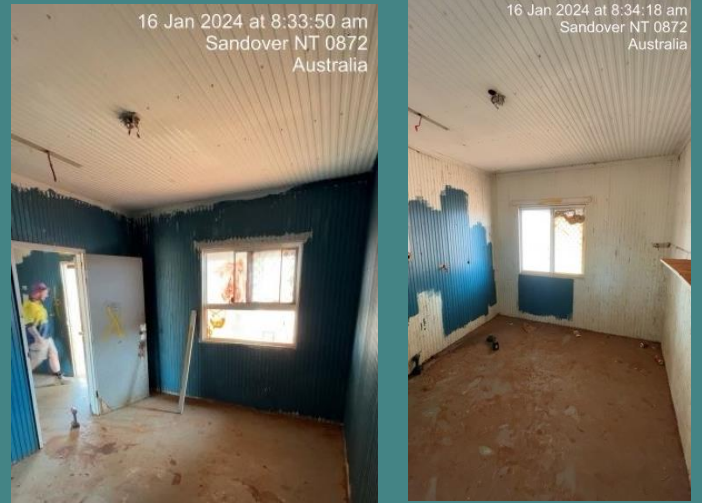
After Bedrooms works completed: